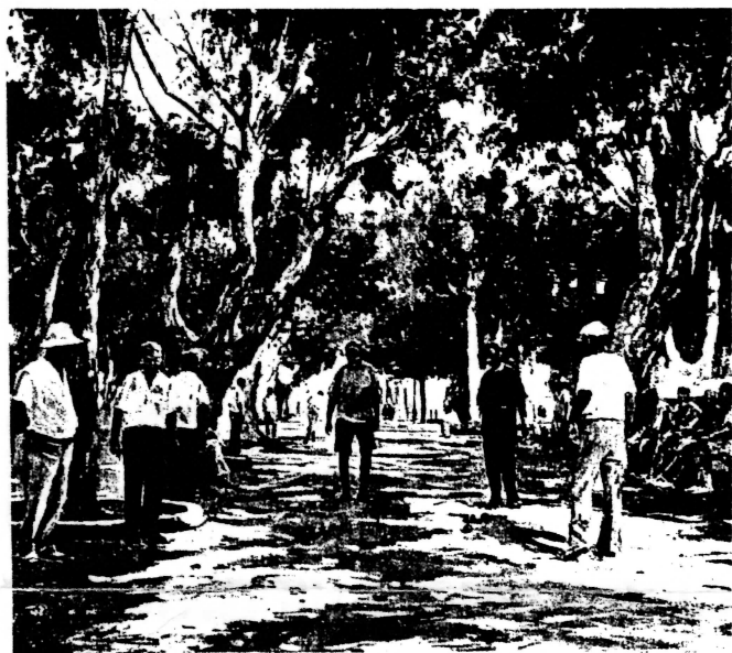
'Boules' in Provence