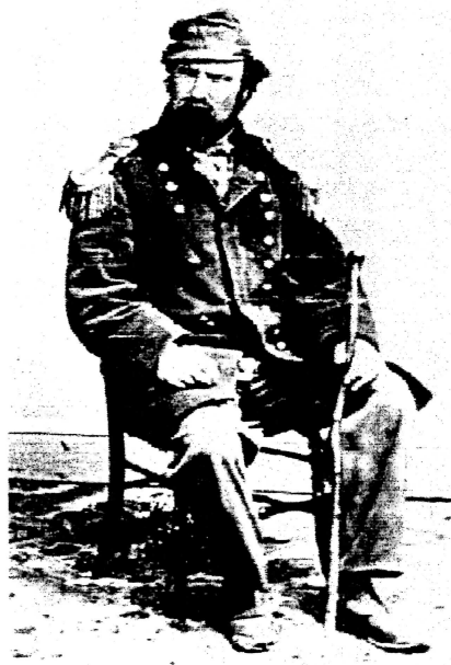
Emperor Norton I Handicap Tournament and Picnic