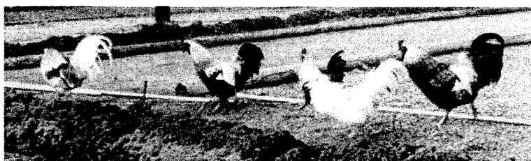
The Pétanque Court roosters are back—walkin' the walk and talkin' the talk. Bring on the new season. We're ready!

Valley of the Moon Pétanque Club PO Box 863 Sonoma, CA 95476